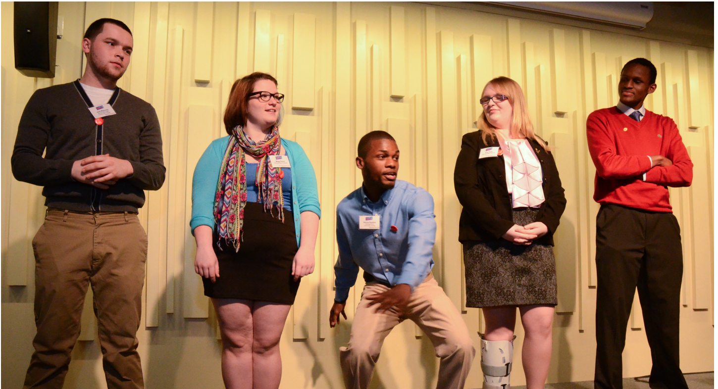
Students participate in a role-playing exercise at the 2013 Student Leadership Conference, held at Fitchburg State University.

The annual Massachusetts Public Higher Education Student Leadership Conference grew from a Massachusetts Board of Higher Education Task Force on the Quality of Student Life, which met from 2000 to 2002 and was charged to collect information from students on current student life conditions and make suggestions for improvement. To help meet that charge, the Task Force held two Conferences on Student Life, one in 2000 and one in 2001, to garner public higher education students' opinions on the condition of academic and student support services, academic advising, communication with students, facilities, parking and transportation.