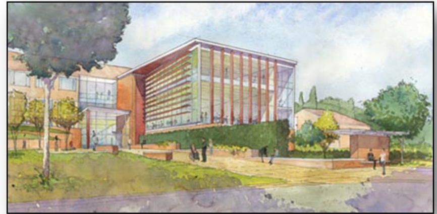
Greenfield Community College Campus Core Modernization